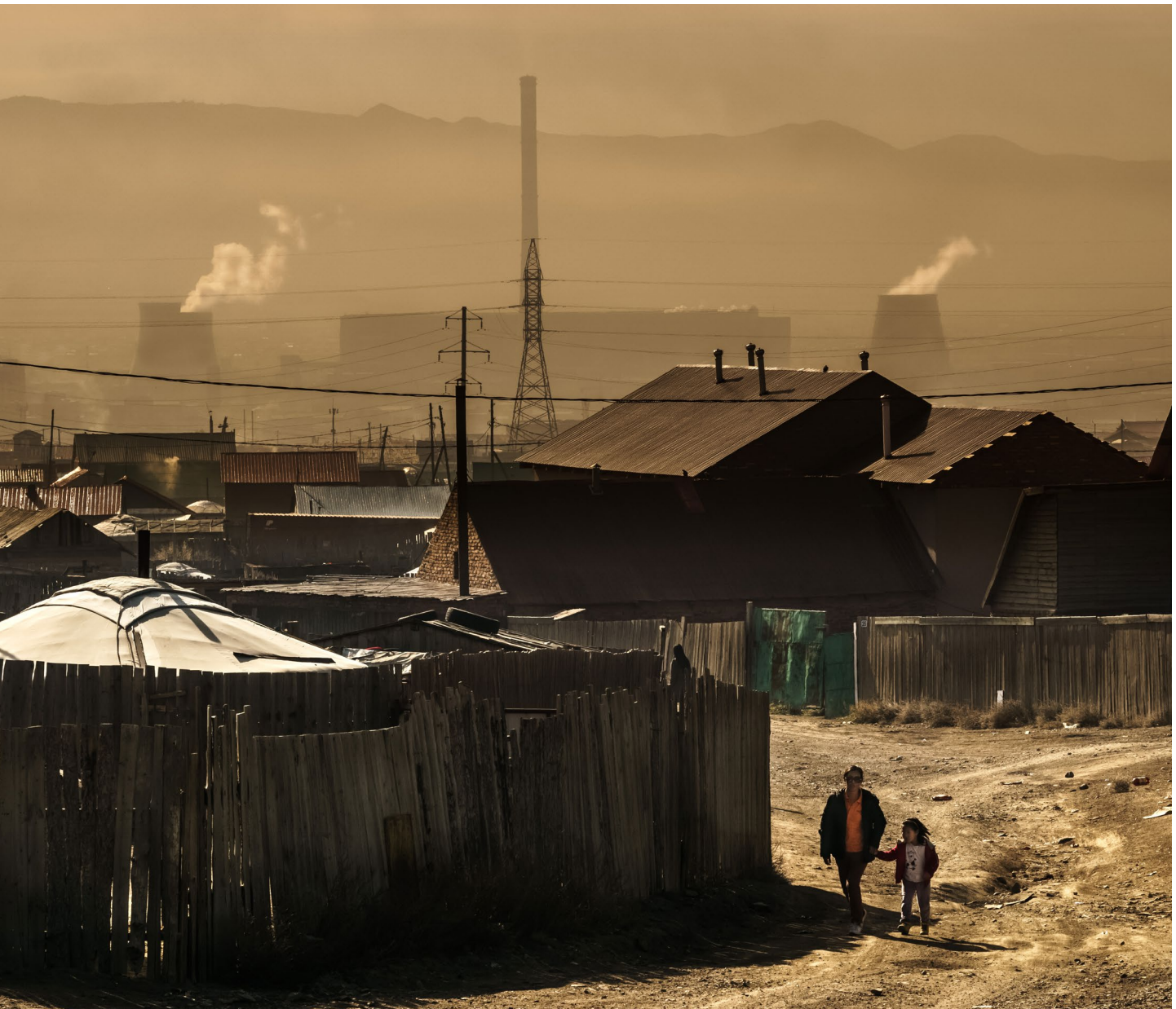
Air pollution captured in Ulaanbaatar, Mongolia.

There is an urgent need to better understand the links between climate-related exposures and MNCH and well-being. Countries need to strengthen existing monitoring frameworks and agree on indicators to track health outcomes with disaggregated, spatially-referenced population data, including the location, characteristics and mobility of populations in areas exposed to current and projected climate hazards. This will improve the quality of services provided and help target resources to populations and areas with the most needs, as well as allow countries to track progress over time.